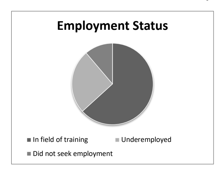
Chart 3: Current Employment Status of the Participants